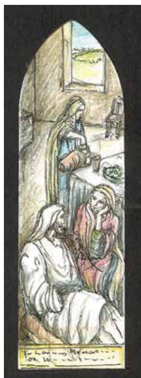
Design chosen for refinement