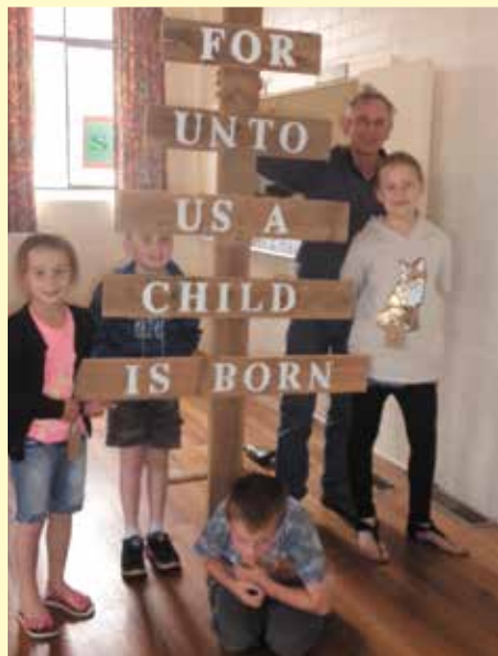
A finished tree sign

On the Monday and Tuesday afternoons before Christmas between 2 and 4 pm a Children's Activity afternoon was held in St. Paul's hall. The program was organised by the combined churches in Korumburra. Members from the Anglican, Baptist, Catholic, AOG, Uniting and Lutheran churches all joined together to make the days a great success with most of the children coming both days.