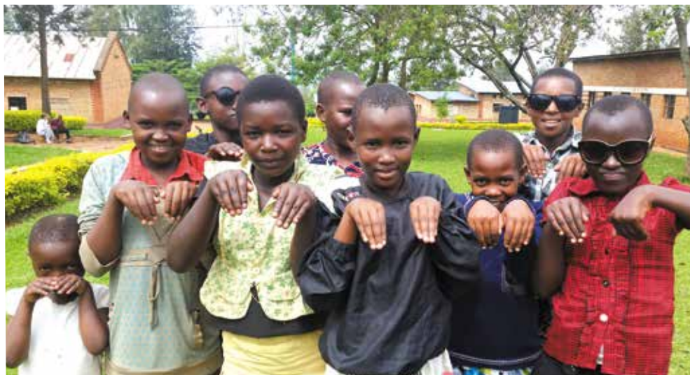
Children learning about kangaroos from their Australian friends