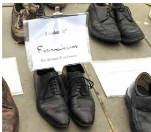
Pope Francis's shoes at the Paris Conference on Climate in December 2015

We welcome summer and the glorious blessing of light. We are rich with light; we are loved by the sun. Let us empty our hearts into the brilliance. Let us pour our darkness into the glorious, forgiving light.