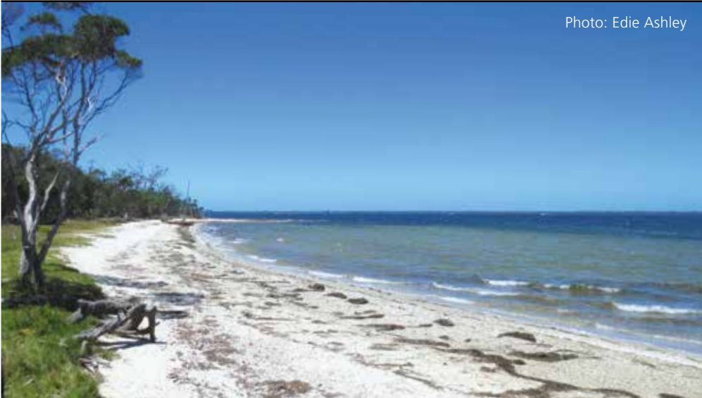
Lake shore, Raymond Island