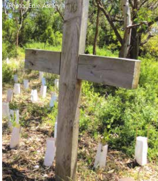
Cross number 10 in The Abbey grounds