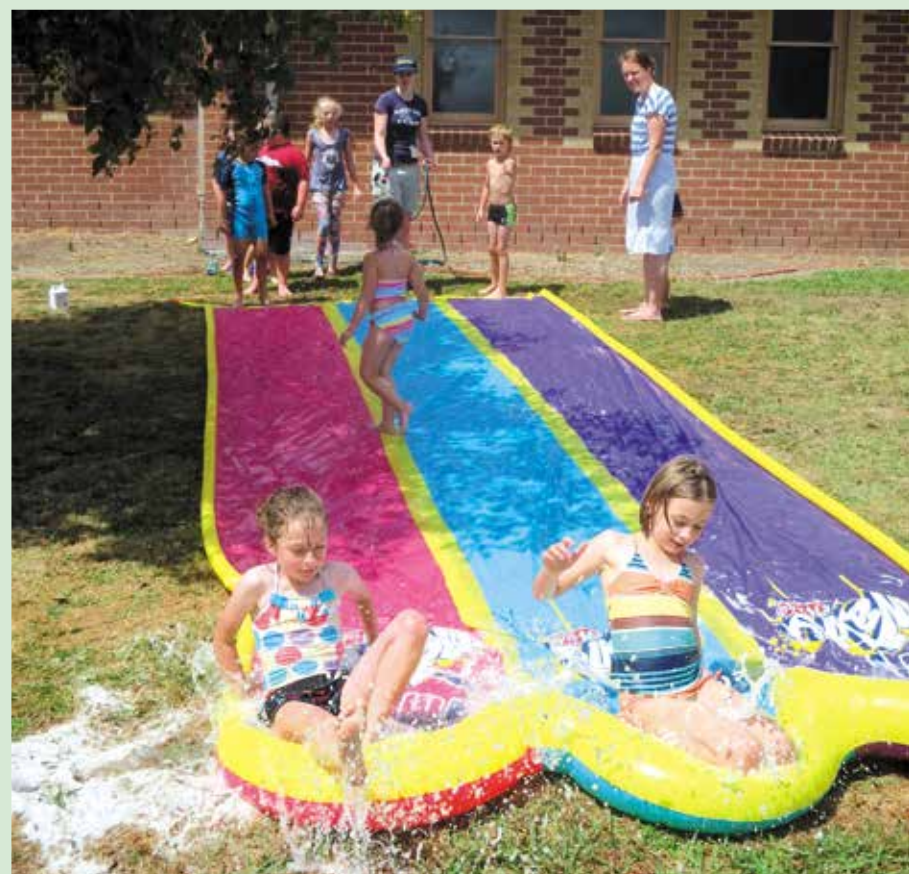
Hot weather fun at Yarragon

Looking at our options we decided that we didn't have the people power to do a big fundraiser, but we could set aside the money that we received at one mainly music session and send it as a special gift to the Excluded Communities fund. We shared with our families what we intended to do and one visiting family even gave special donation. It was only a small beginning but we also recognise that it would be quite simple to do it again a few times during the year and so enable others to be blessed by the mainly music ministry.