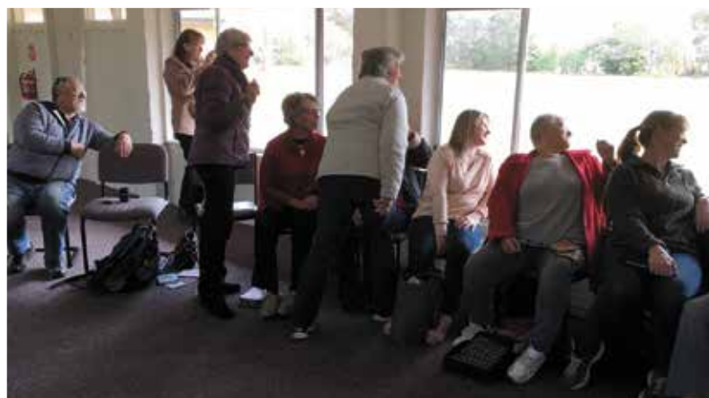
A koala causes distraction during talks at the Abbey retreat