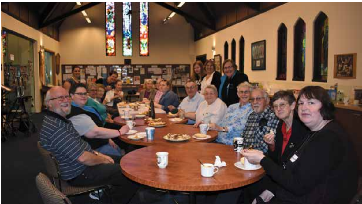
GFS Adult Friends with group following Commissioning Service and Leader Development workshop at Drouin

Optional horse riding activity extra cost