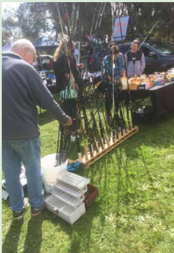
First Community Market Day for St George's Coriella