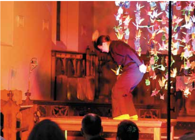
Two mimes were performed on the altar: the sacrifice of Iphigenie, Agamemnon's daughter (from Greek mythology) and later, the biblical Abraham-Isaac story, speaking of the "human predisposition and inclination towards violence, exploitation and the silencing of the voice of conscience" (program notes).

be mentioned here, and a long list of acknowledgements and thanks to all those who assisted was included in the program notes.