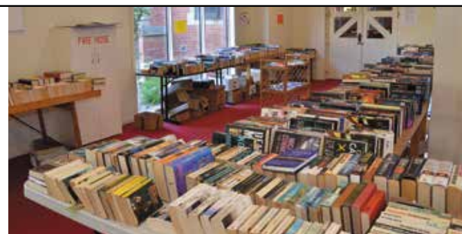
Books ready for sale at St Paul's Cathedral, Sale

Two large trailers of leftover books were donated to CFA Yarragon for their annual Book Fair. Local op shops also received a selection of the leftovers.