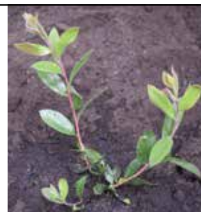
Bottlebrush now planted at entrance to the Parish Community Garden

People from both churches were involved in the