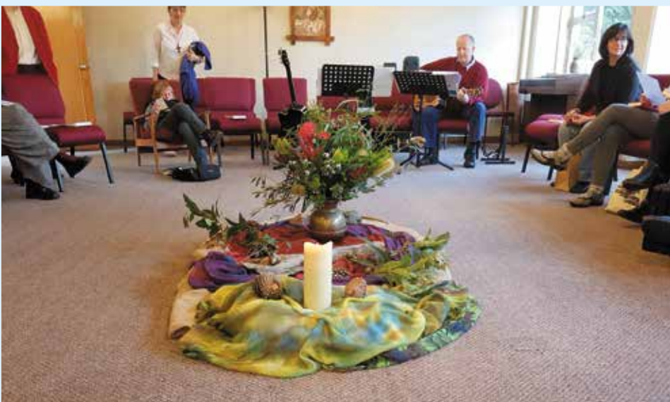
Clergy retreat at Pallotti College in October