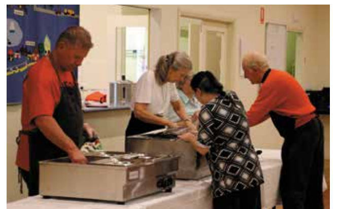
Kitchen workers at the Synod Dinner, St Paul's Cathedral 2016