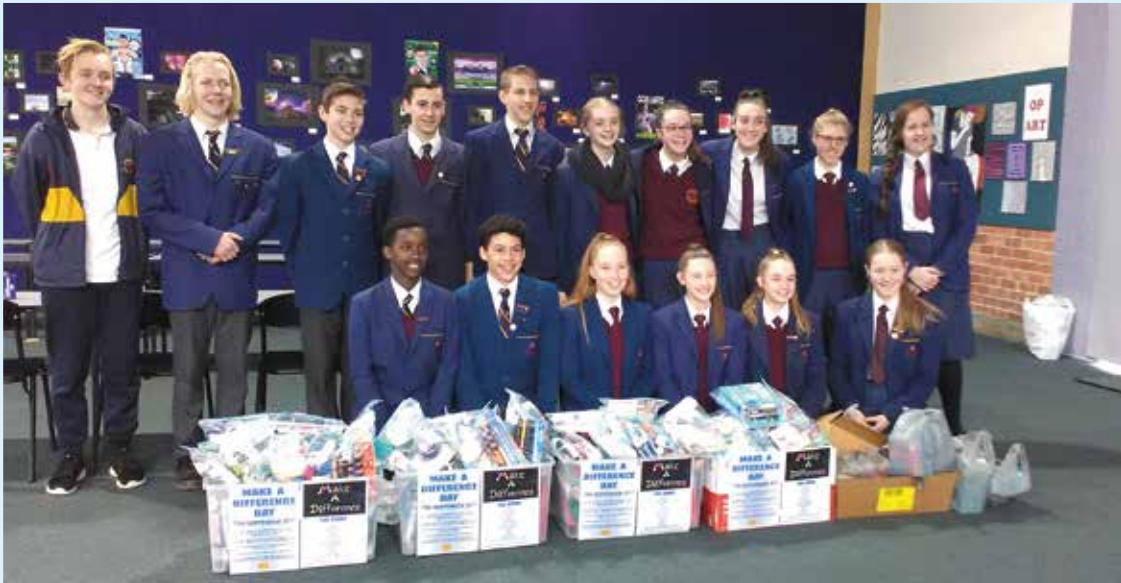
The team of year 9 students who packed the hygiene bags for homeless young people