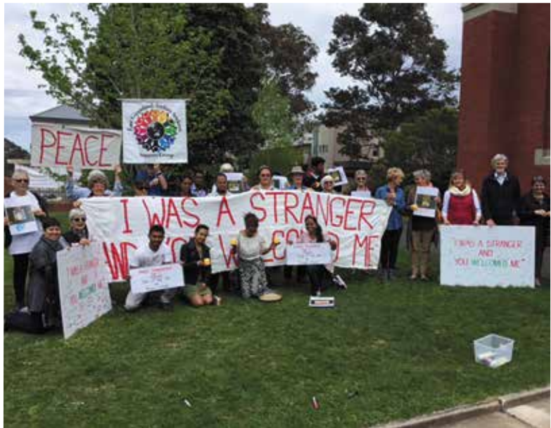
The silent vigil for asylum seekers, held in Bairnsdale

Gippsland Asylum Seekers Support Group based in Bairnsdale, which includes Christians from different traditions as well as people from the broader community. The group's banners on that day read "Manus and Nauru, Not Safe For Refugees # Bring them Here". Another, a verse from St Matthew's Gospel (25:35) "I was a stranger and you welcomed me."