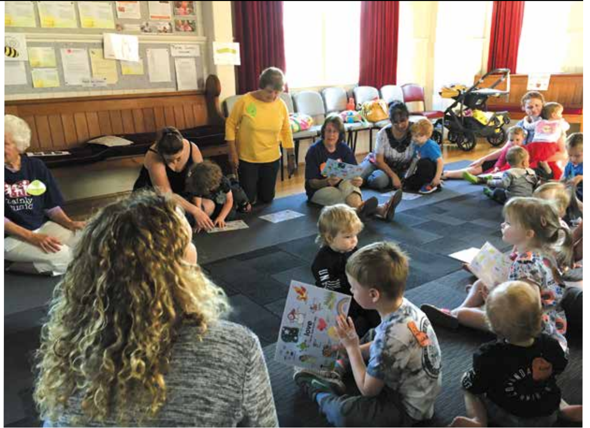
Kids' Min in full swing at Avon

In all of this I've been amazed at the teams co-ordinating both the programs for our Sunday School and mainly music . Their passion and commitment to ensuring our church is able to actively engage with our children and youth is an encouraging sight to see, a team with a great outlook, still young at heart.