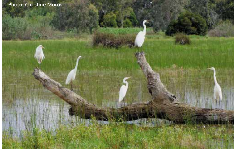
By still water

Be present, merciful God, and protect us through the hours of this night: that we, who are wearied by the changes and chances of this fleeting world, may rest on your eternal changelessness; through Jesus Christ our Lord Amen