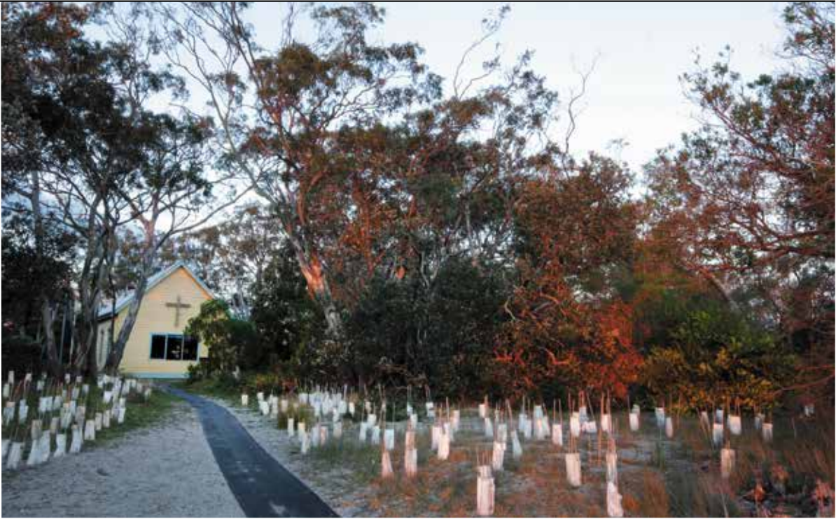
Revegetation work near the Abbey of St Barnabas on Raymond Island