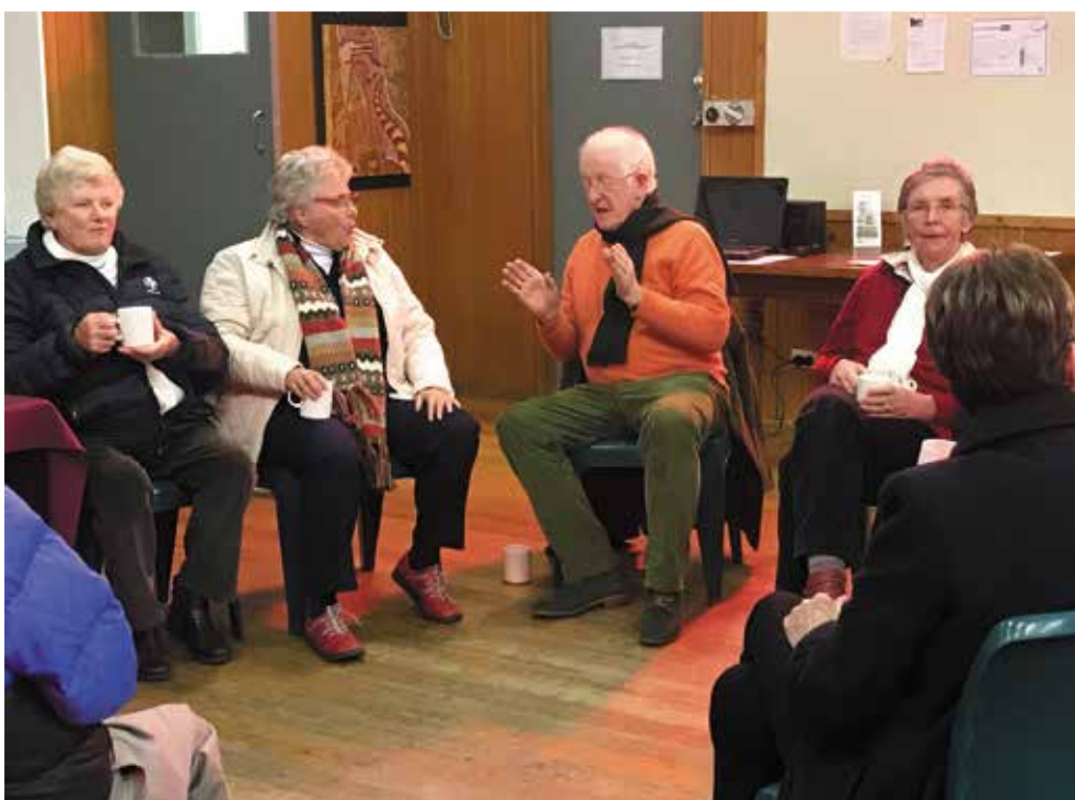
Participants warming up with a cuppa at the workshop