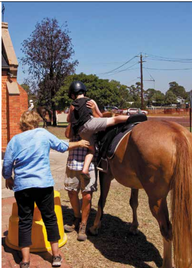
Pony rides were popular at the Avon Family Fun Fair