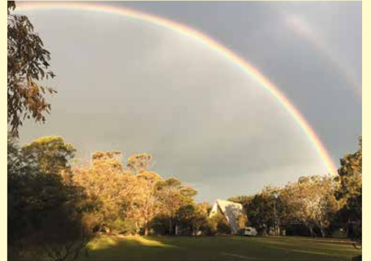
Rainbow over The Abbey on Raymond Island