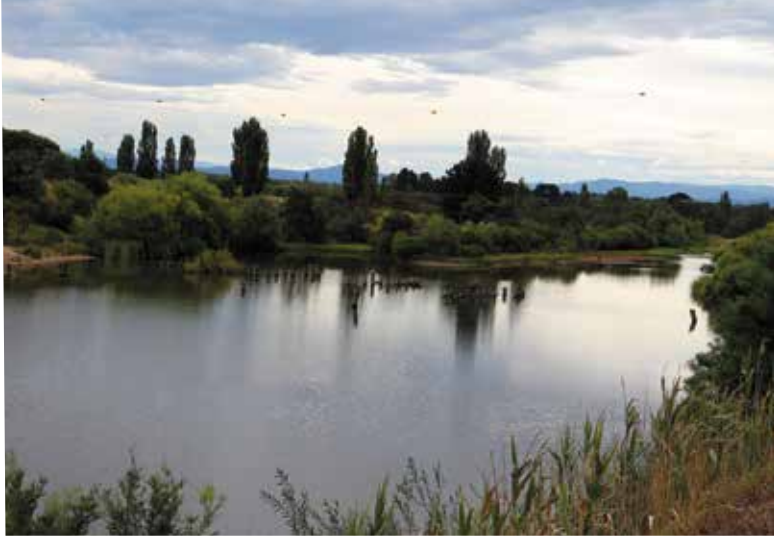
Avon River at Stratford