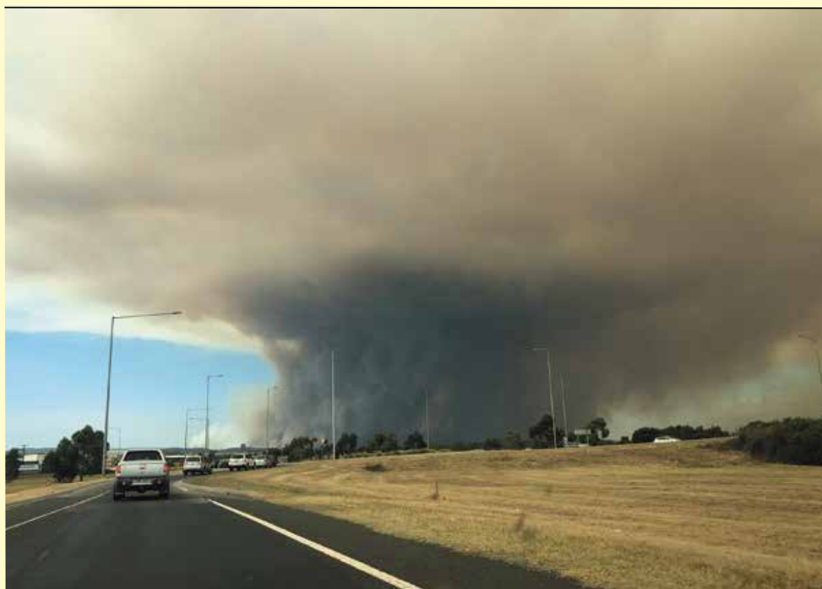
Packenham turn-off on 2 March

While fire-fighters worked long and hard to contain more fierce fires in early March (some of which are still going), Victorian Council of Churches Emergency Ministry team members were on hand to support people in need, who in turn supported one another. Many people have rallied to give practical assistance to those who had lost homes or other property.