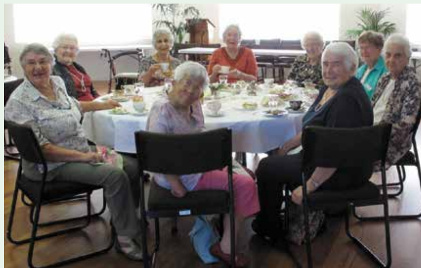
The annual Bairnsdale MU afternoon tea

Mother's Union, for their second annual afternoon tea, invited past and present parishioners. It was beautifully served with special cups and saucers and silver teapots. There were dainty sandwiches, cakes and a sponge cake that just had to be eaten.