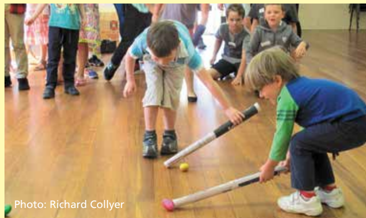
Easter egg hockey at St Paul's, Korumburra

items needed for making the dioramas, books and bags to carry them home. Praise the Lord! This was the largest number of children who have attended these holiday activity days.