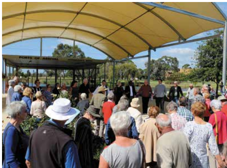
In solidarity: holding hands for the blessing