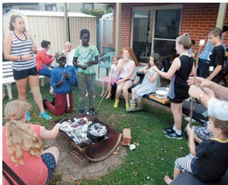
Toasting marshmallows at Earth Hour, Trafalgar

There were people from various parts of the community as well as people from the congregations. This year was the 10th anniversary of Earth Hour, a time when across the world we are encouraged to remember that our energy resources need to be managed well if future generations are to share our standard of living.