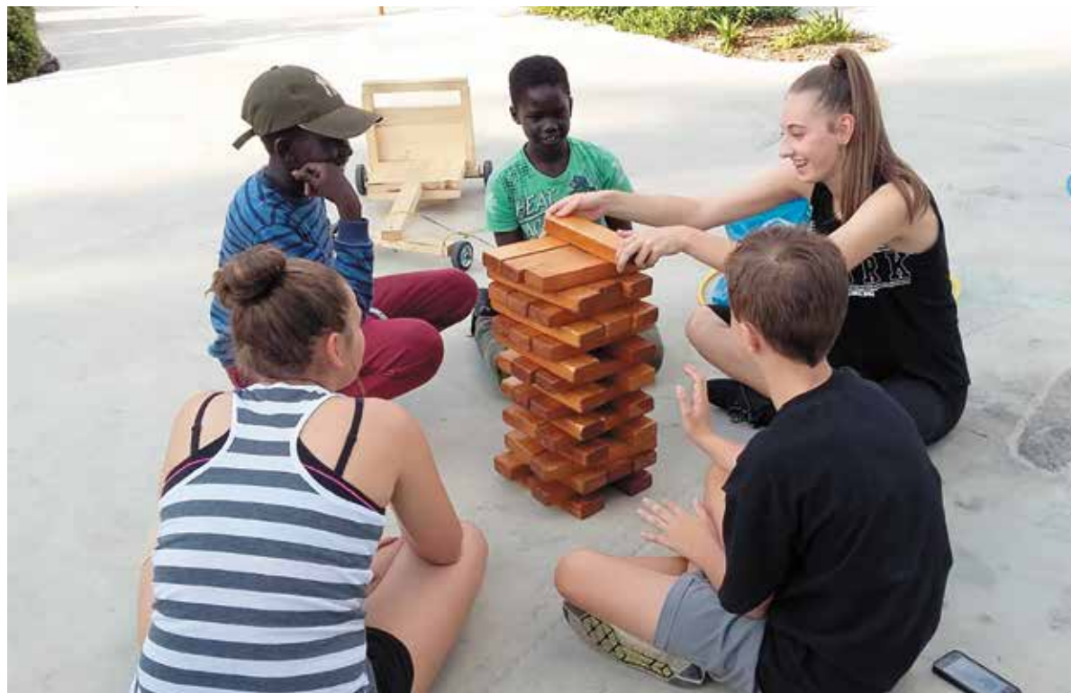
St Mary's young people joined in the Earth Hour fun at Trafalgar