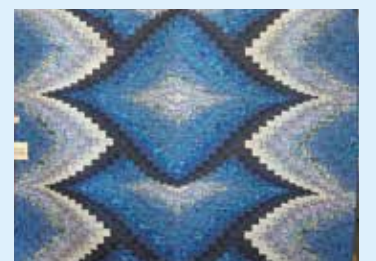
Details of quilts on display at the annual Lang Lang Quilt Show