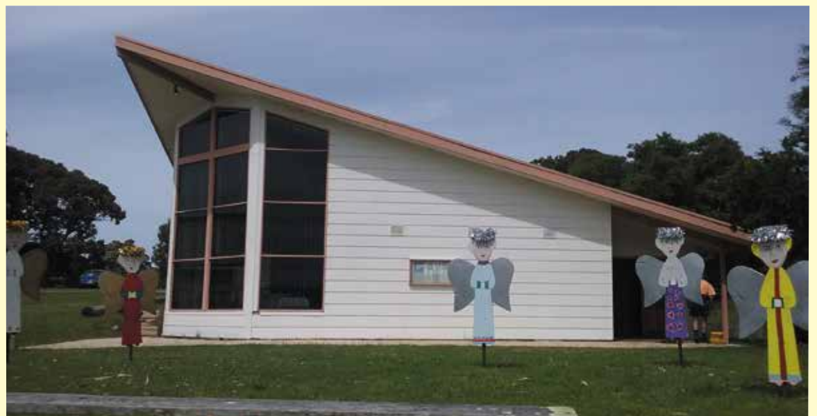
St Peter's Mallacoota (parish of Croajingolong)