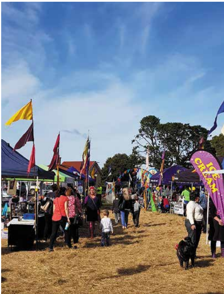
Medieval Faire Day and Makers Market at the Shakespeare Festival in Stratford

The evening was well supported and everyone was invited to an abundant supper in the parish hall afterwards, with a variety of soups, sandwiches and slices.