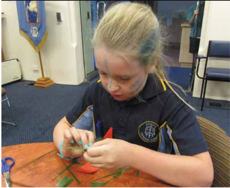
Crossover of ages: the Drouin Mothers' Union taught the youth group to make palm crosses