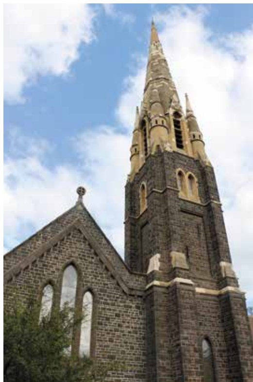
Christ Church South Yarra