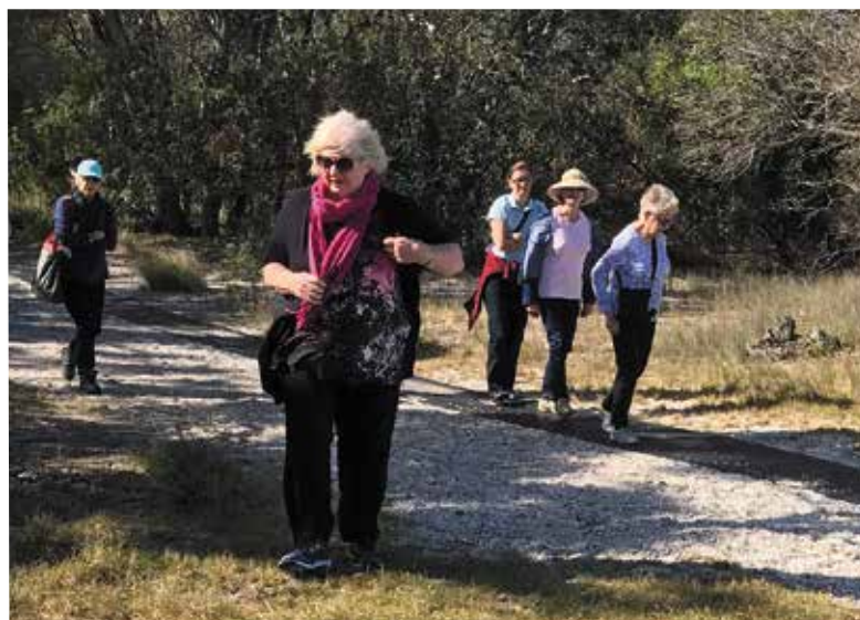
Pilgrims walking on Raymond Island

preceded with a cosy Friday night and an “on the beach” church service on the Sunday morning, with plenty of time to stop and reflect, to give praise and wonder, to sit with the environment that seemed to enfold us with the grace and wonder of God.