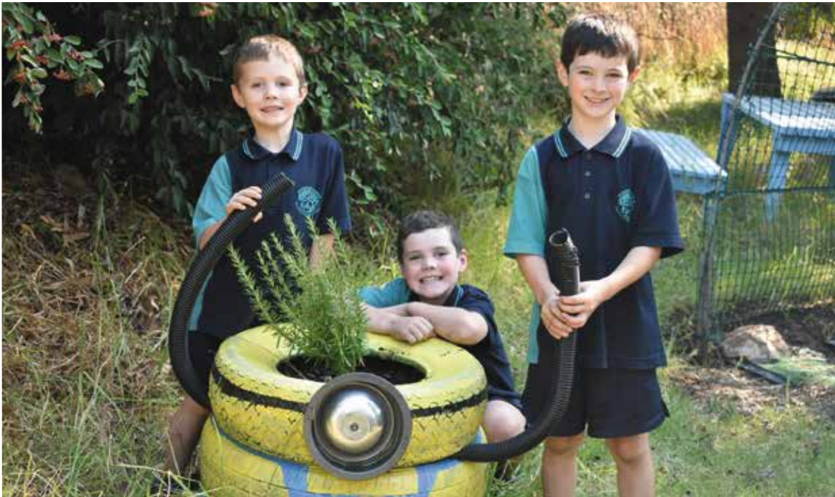
Children in the parish community garden

We thank the children's ministry team and the parents/grandparents for their enthusiastic commitments towards this work-in progress.