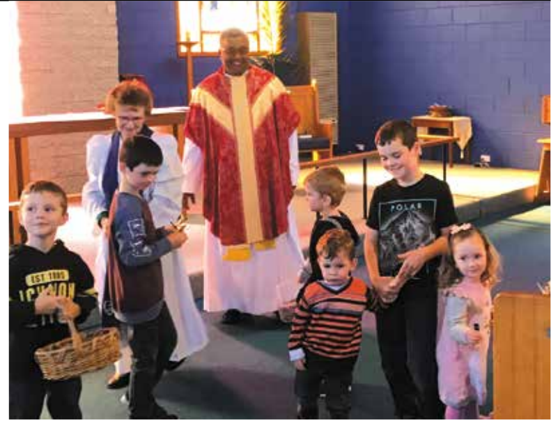
Children happily helping to give out palm crosses

Enthusiastic volunteers have been advised that missing the "sermon moment" on Sundays while providing children's ministry is nothing to fret about. It is also an