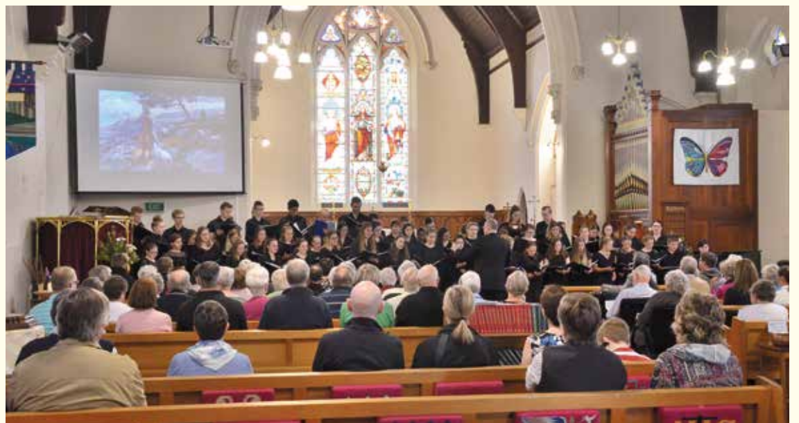
Members of Trinity University Choir joined with Gippsland Grammar students to sing at St Paul’s Cathedral, Sale on 22 April, as part of a whole weekend of musical activities