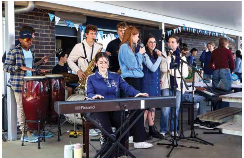
St Paul's Soul Band providing musical entertainment

As its first activity, the St Paul's Interact Club organised 'Do It For Dolly Day', raising funds and