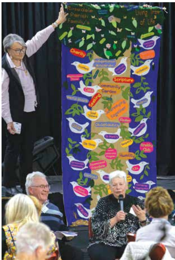
An artwork created by the parish of Rosedale demonstrating their reach amongst the local community