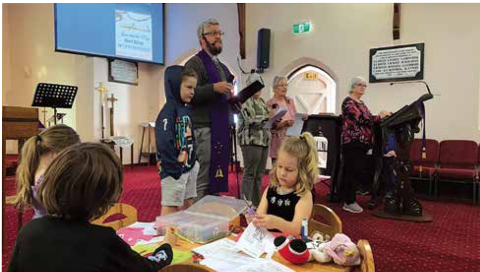
The all-ages service at Stratford

'There was a lot more people, a lot more engagement inside church and outside church. We had our service and were joined afterwards for morning tea,' she said. 'We had playgroup, community health sessions. We would sit and knit and crochet or just chat as a social gathering.' But now, she's the lone, and soon-to-be last, parishioner at All Saints, which was recently marked for closure.