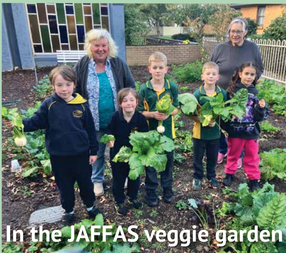
Learning and growing in the JAFFAS garden